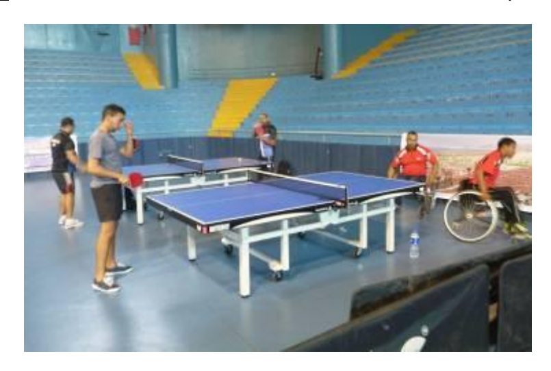
Practice Hall: Located at the back of the arena with 3 tables and separated by a tent.